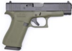
License to Carry (LTC) Range