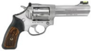
License to Carry (LTC) Range

HANDGUNS ONLY. NO RIFLES, RIFLE CALIBER FIREARMS, PISTOL CALIBER CARBINES, AR/AK PISTOLS, SHOTGUNS, SHOTGUN PISTOLS, LEVERGUNS, OR LONG GUNS OF ANY KIND.